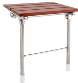
15.312 white finish