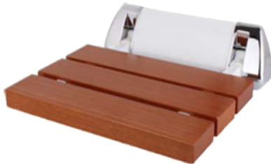
15.311 white finish