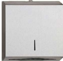
Reference: 14.102 AISI 304 stainless steel bright or satin