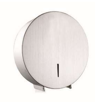
Reference: 14.101.B AISI 304 stainless steel bright