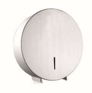
Reference: 14.101.S AISI 304 stainless steel satin